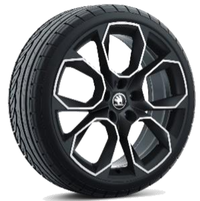
19" 'XTREME' Gloss Black Alloys STANDARD ON RS245