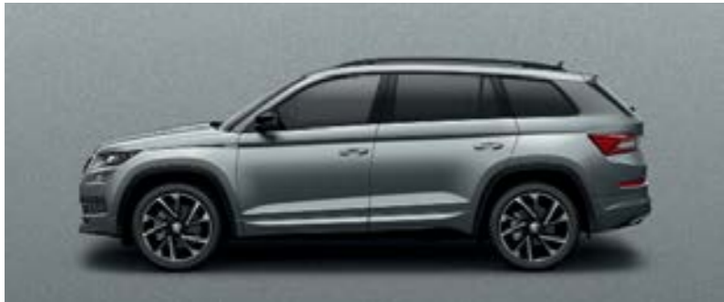
BUSINESS GREY METALLIC