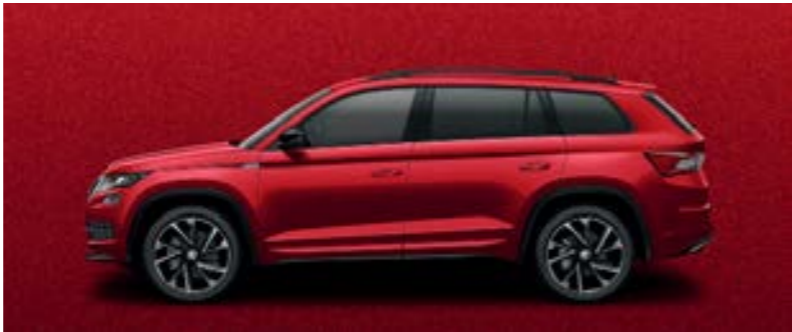
VELVET RED METALLIC