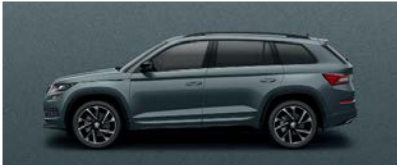
QUARTZ GREY METALLIC