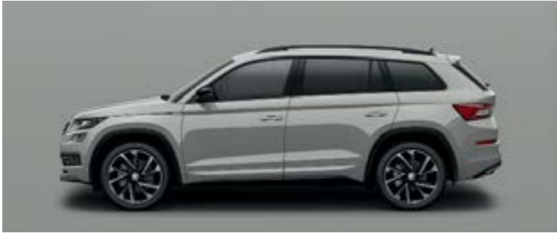
STEEL GREY UNI