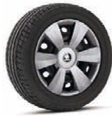
15" DENTRO hub covers