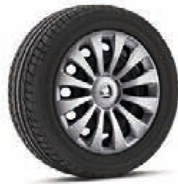
15" COSTA hub covers