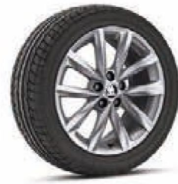
16" VIGO silver alloy wheels