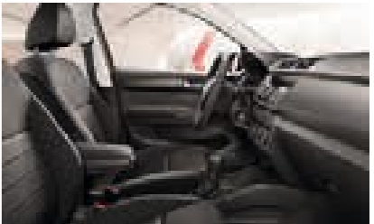
AMBITION GREY INTERIOR Basket Narbe Black décor Fabric upholstery