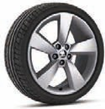
17" CAMELOT alloy wheels