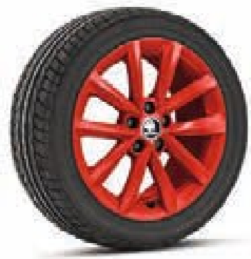
16" VIGO red alloy wheels