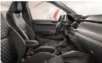
DYNAMIC BLACK INTERIOR Dark Brushed décor Fabric upholstery/Suedia