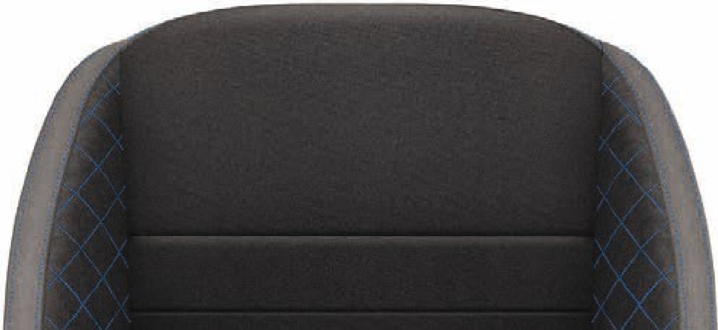
Ambition Blue (fabric)