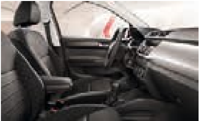
AMBITION GREY INTERIOR Light Brushed décor Fabric upholstery