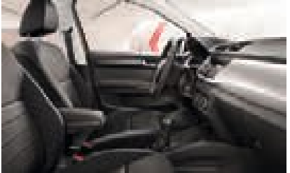
AMBITION BLUE INTERIOR Light Brushed décor Fabric upholstery