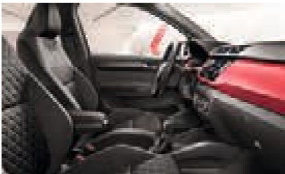
DYNAMIC BLACK INTERIOR Cherry Red décor Fabric upholstery/Suedia