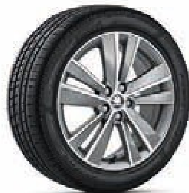
17" CAPRICORNUS anthracite metallic alloy wheels, brushed