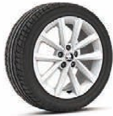
16" VIGO white alloy wheels