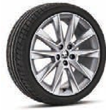
17" SAVIO alloy wheels