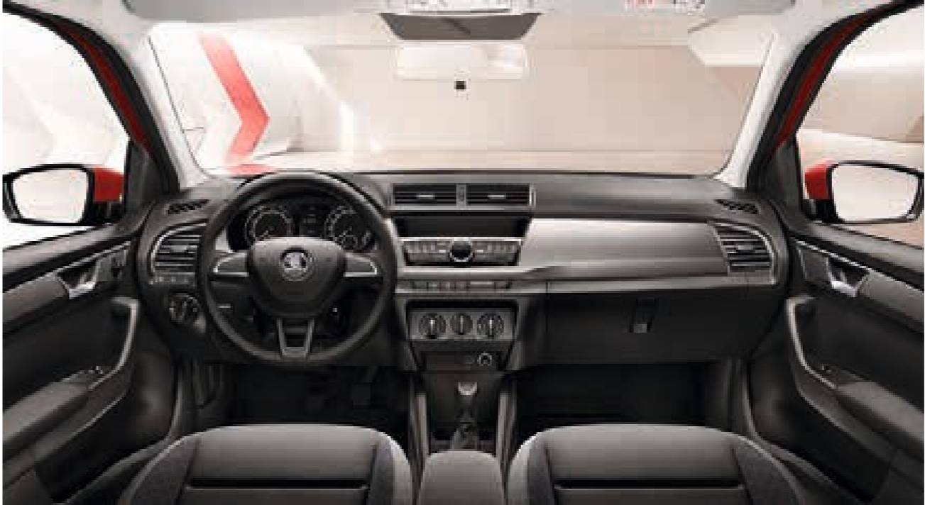
AMBITION BLUE INTERIOR Light Brushed décor Fabric upholstery

The standard equipment of the Ambition version includes external side-view mirrors and door handles in body colour, chrome/silver package with decorative interior elements, electrically-controlled front windows, umbrella under the passenger seat, sunglasses compartment, height-adjustable driver seat, plus more.