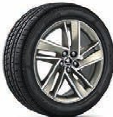
17" BLADE platinum matt alloy wheels, brushed