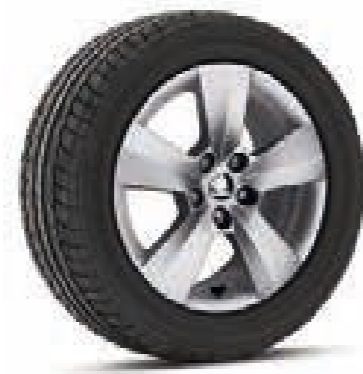
15" MATONE alloy wheels