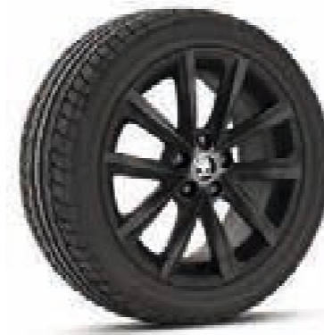
16" VIGO black alloy wheels