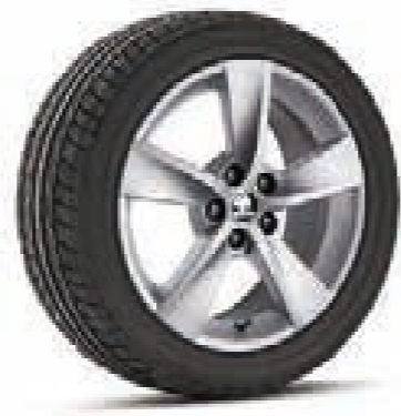
16" EVORA alloy wheels