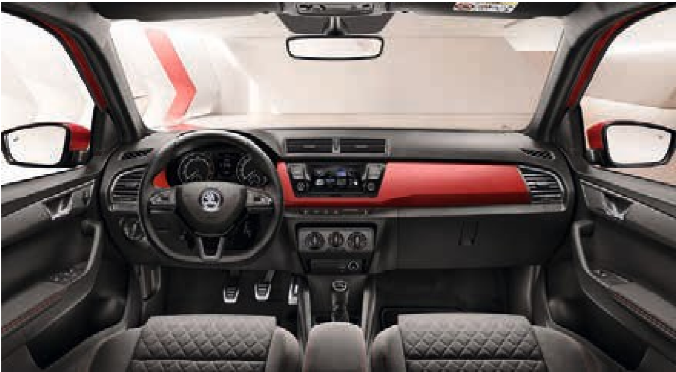
DYNAMIC BLACK INTERIOR Cherry Red décor Fabric upholstery/Suedia

The exclusive sports seats in a special design, multifunctional sports steering wheel, door panelling with red stitching, black ceiling, pedal covers in alloy design and sports chassis underline the dynamic character of your car. The Dynamic package is available for the Ambition and Style versions as extra equipment.