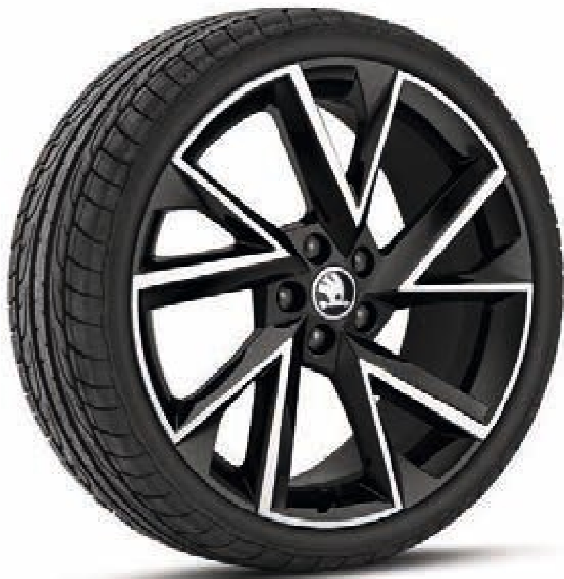
18" VEGA black alloy wheels